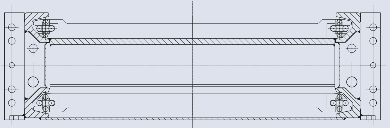
Cross section view HHC with casted profiles